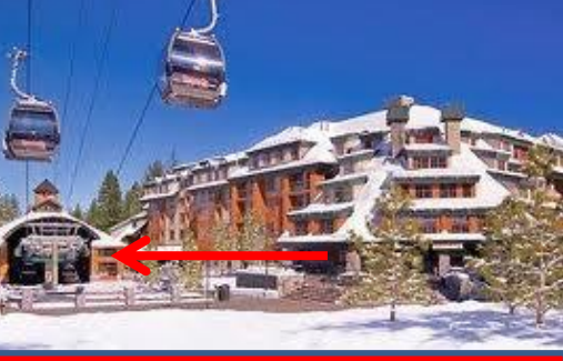
All suite rooms living room + bedroom